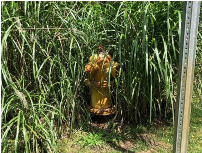
An example of an obstructed hydrant.

If you have a fire hydrant on or near your property, the Cascade Fire Department requests your assistance in maintaining the required clearance.